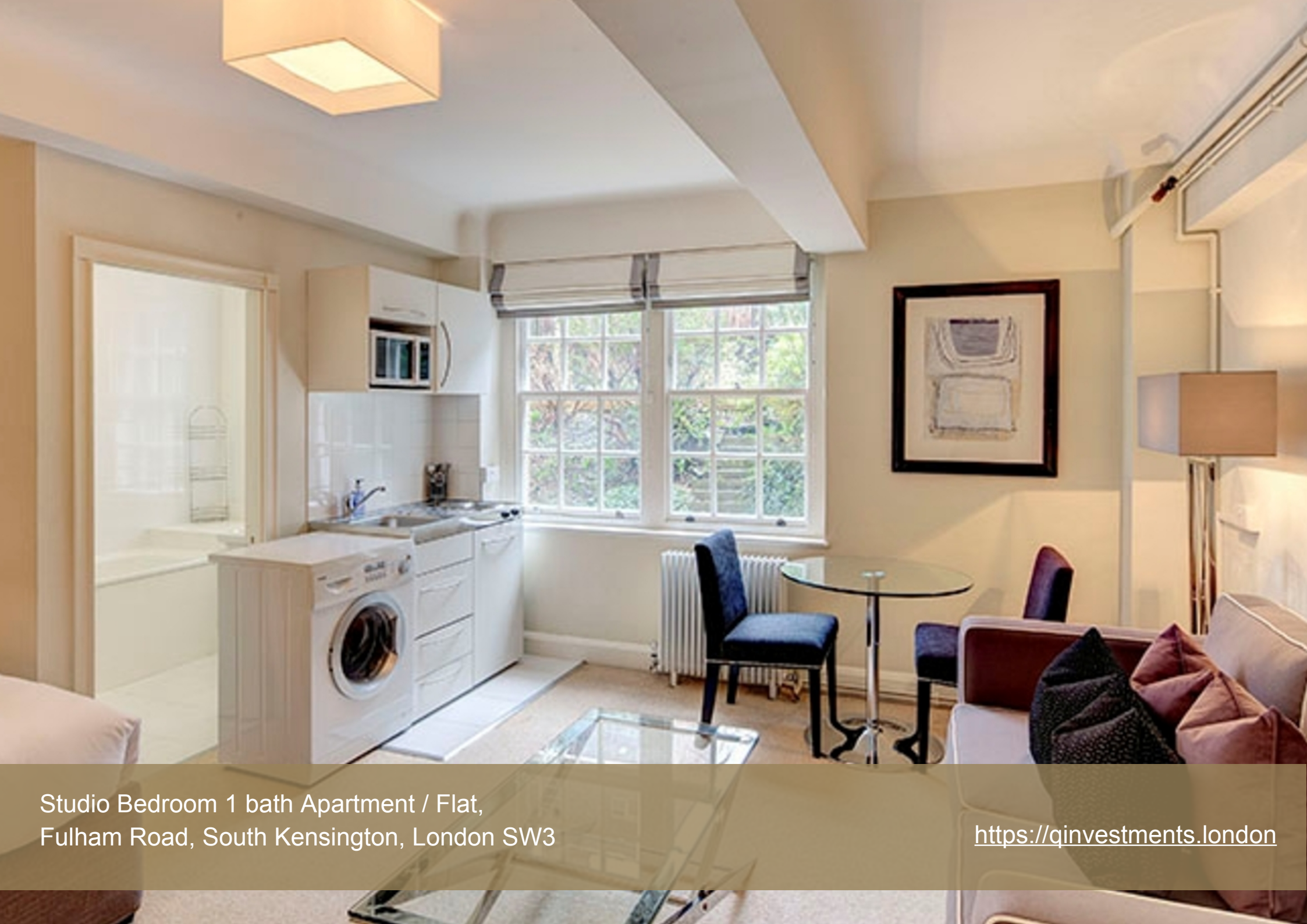
Studio Bedroom 1 bath Apartment / Flat, Fulham Road, South Kensington, London SW3