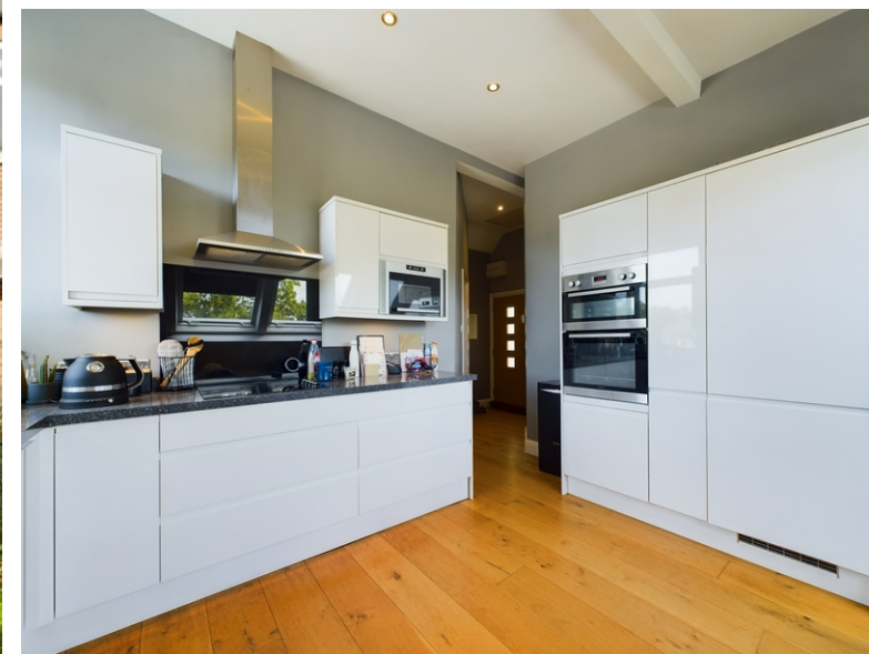
Flat 15 Bayman Manor, Lye Green Road, Chesham, Buckinghamshire, HP5 3NF