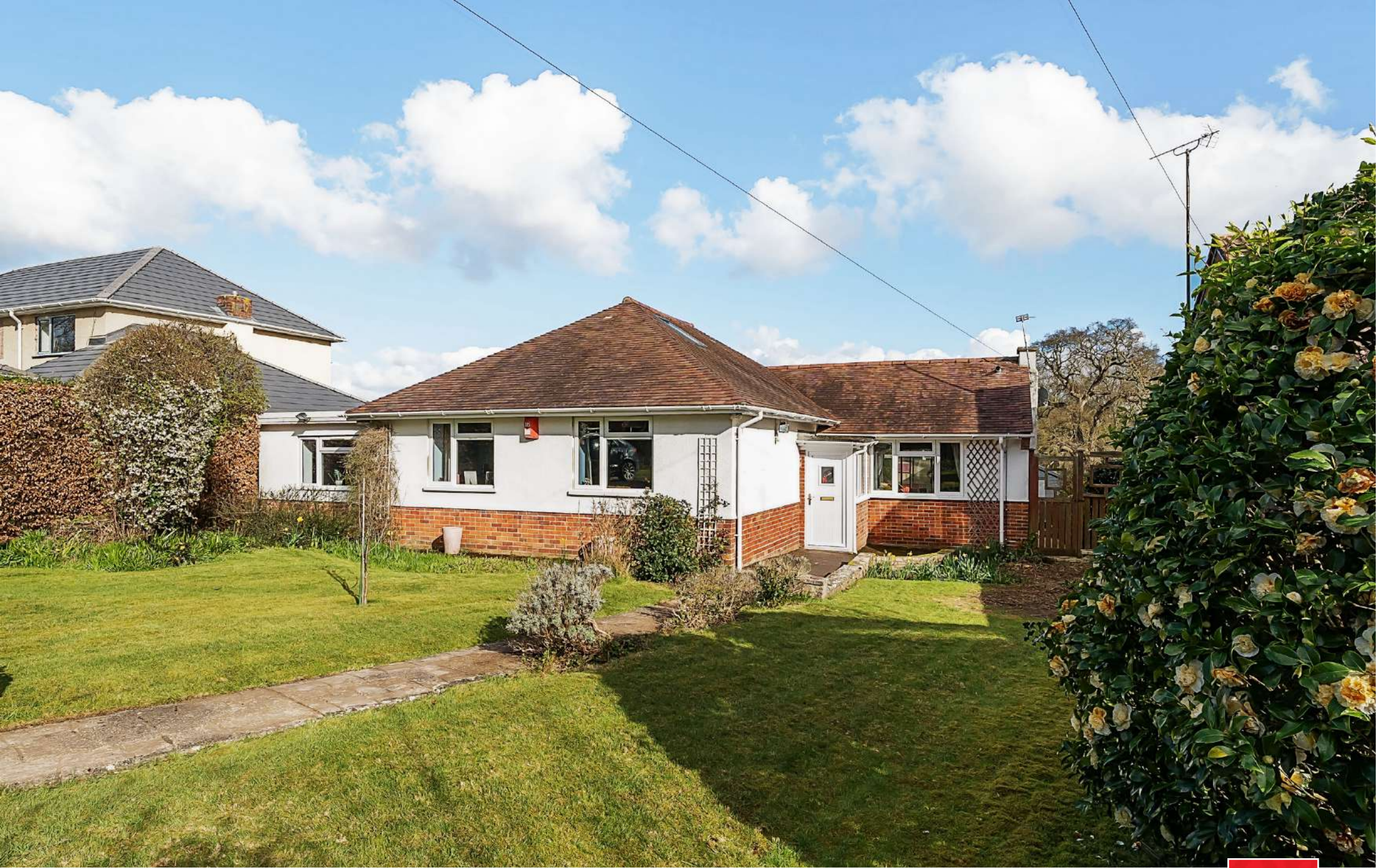
Linden Lea Wild Oak Lane, Trull, Taunton TA3 7JT