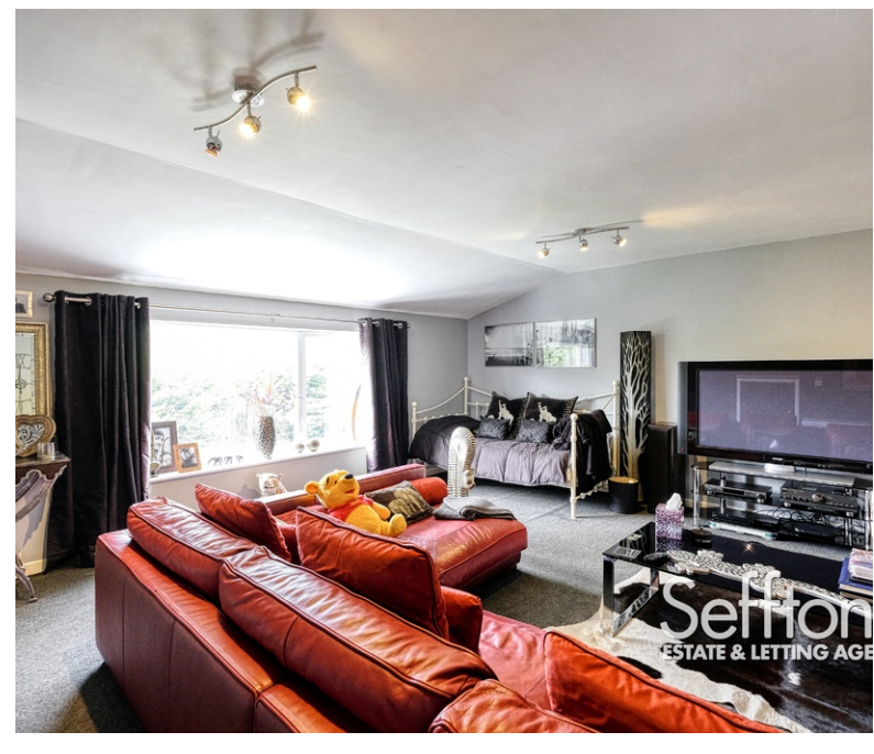
Newlands, Diss, IP21 4ED

This SPACIOUS, DETACHED FAMILY HOME boasts GENEROUS ACCOMODATION throughout, with FIVE BEDROOMS and an IMPRESSIVE PLOT spanning around 0.3 Acres (STMS). The property is well equipped with a STUDY, UTILITY and BREAKFAST ROOM, in addition to several outbuildings- this opportunity is NOT TO BE MISSED.