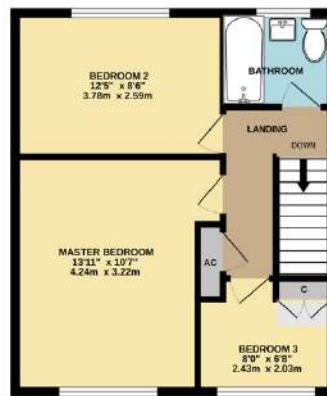
1ST FLOOR 424 sq.ft. (39.4 sq.m.) approx.