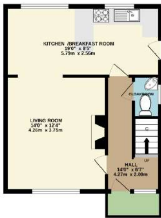
GROUND FLOOR 417 sq.ft. (38.8 sq.m.) approx.