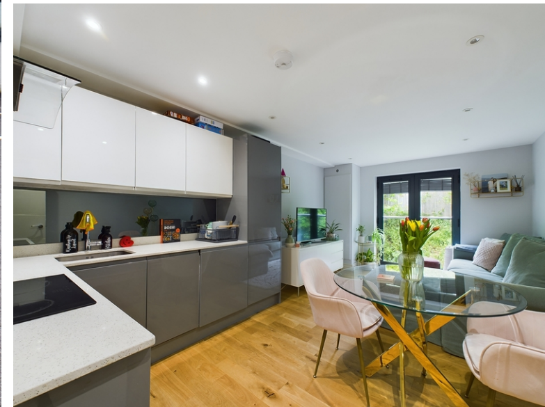
Flat 2 Treadaway Court, Loudwater, High Wycombe, Buckinghamshire, HP10 9QL