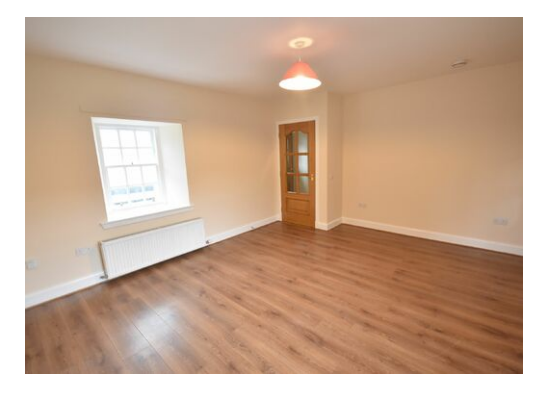
Fixed Price £125,000

2 Bedroom Detached Cottage located in the heart of Rothes.