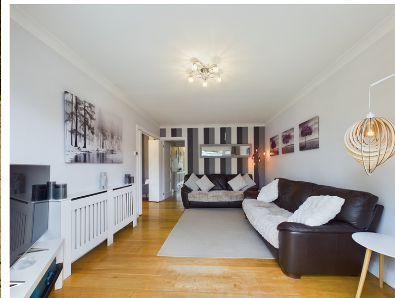
2 The Rosary, Holmer Green, High Wycombe, Buckinghamshire, HP15 6UJ