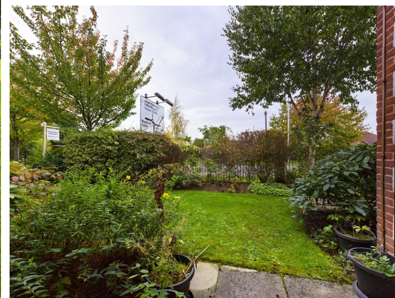
8 Hughenden Court, Penn Road, Hazlemere, Buckinghamshire, HP15 7BP