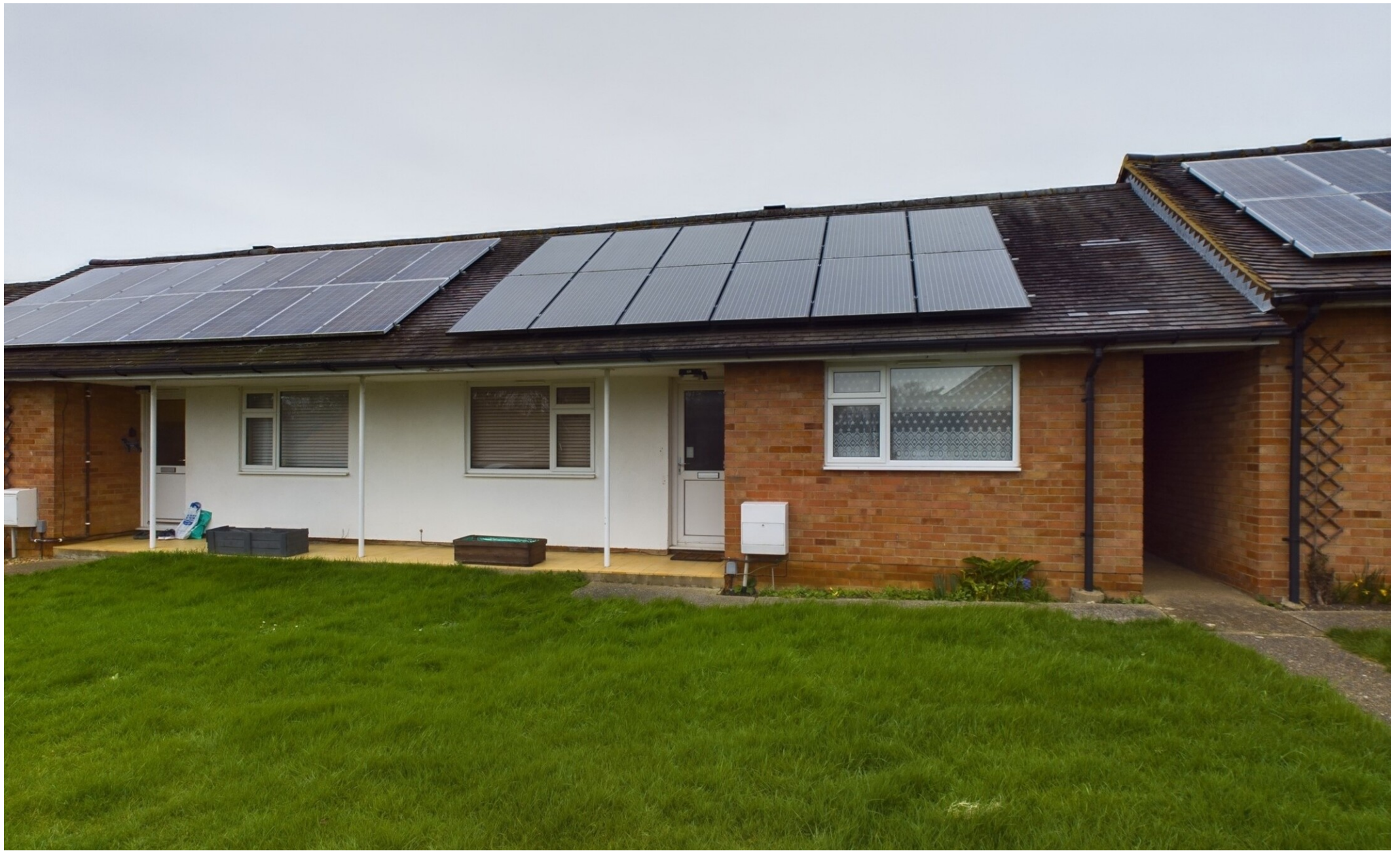
The Dale, Longstanton CB24 3DH