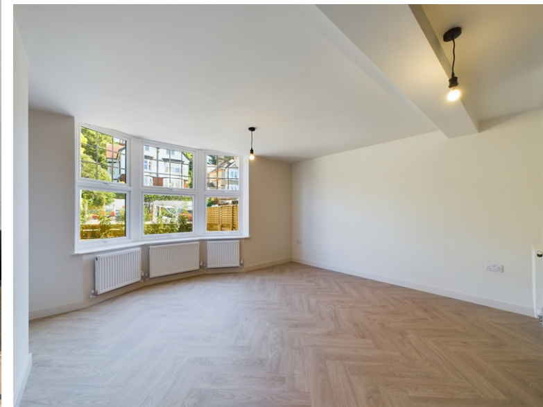
Flat 1, 148 London Road, High Wycombe, Buckinghamshire, HP11 1DQ