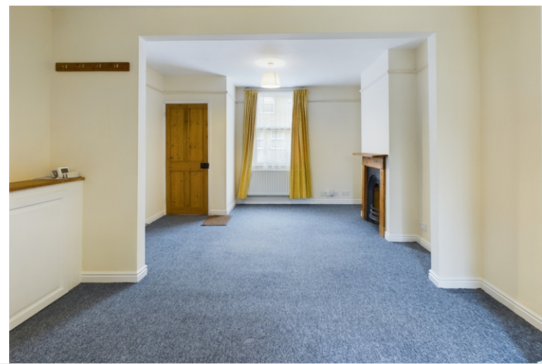
Selwyn Road, Cambridge, CB3 9EA

£1,600 pcm Part Furnished 2 Bedrooms Available from 01/05/2024