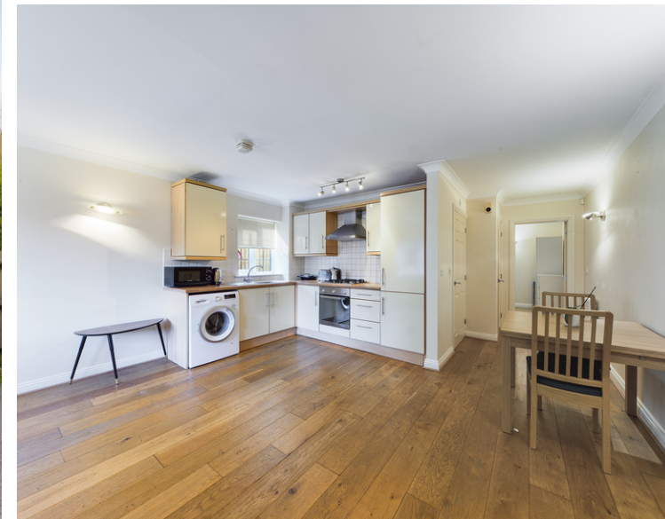
Flat 2 Imperial Court 230 West Wycombe Road, High Wycombe, HP12 3AR