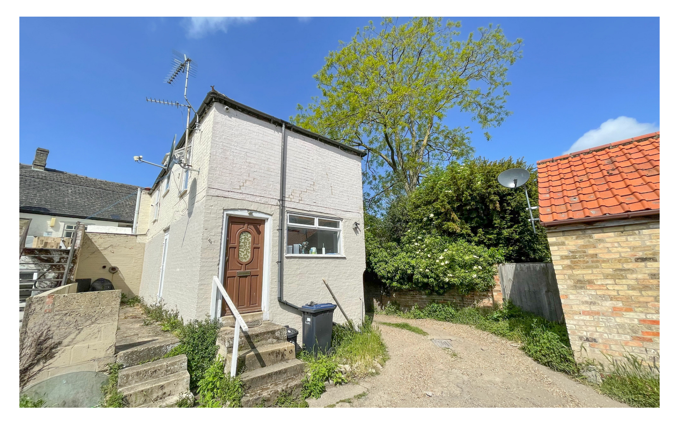
High Street, Soham, Cambridgeshire