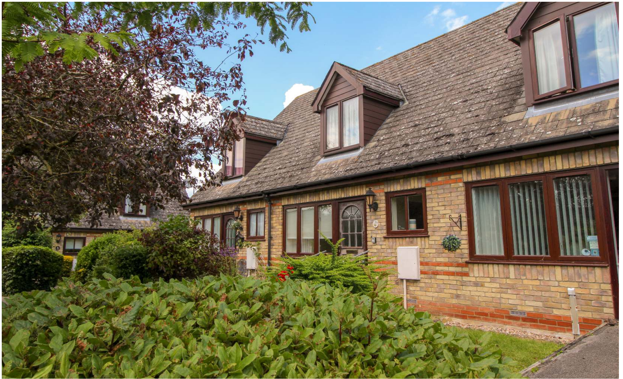
Ash Grove Burwell Cambridgeshire