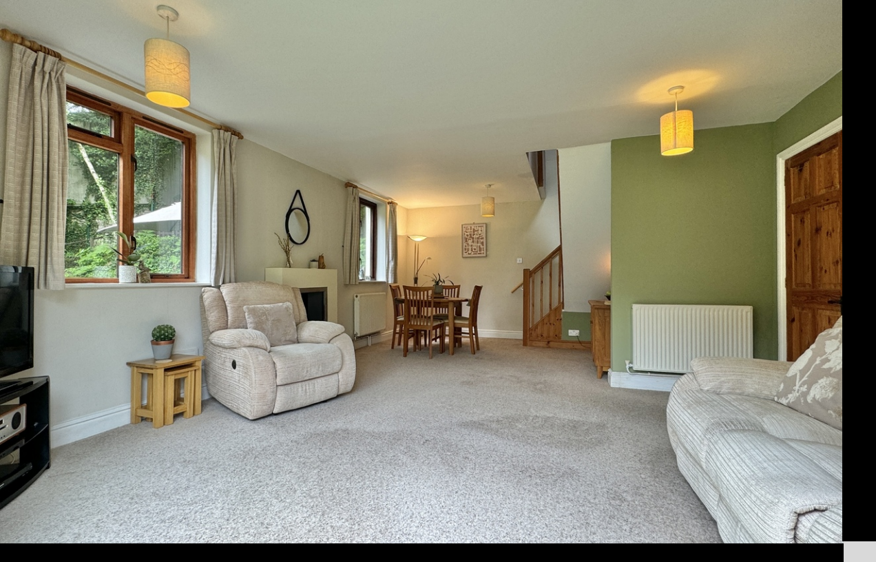
Our View "Viewing highly recommended to fully appreciate this delightful property, the outside space and its tucked away location."