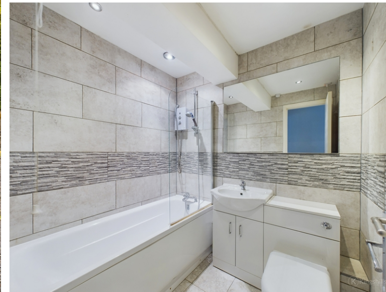
Sandringham Court, Malmers Well Road, High Wycombe, Buckinghamshire, HP13 6NB