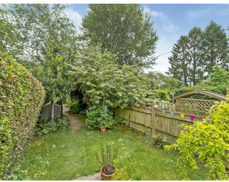
Golf Link Cottages, The Common, Downley, High Wycombe, HP13 5YJ