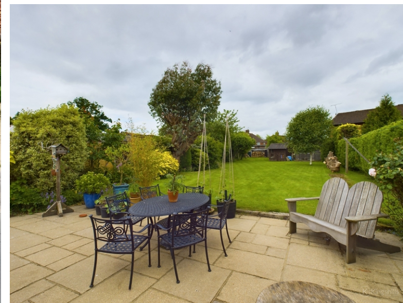
1 Coppice Farm Road, Penn, High Wycombe, Buckinghamshire, HP10 8AN