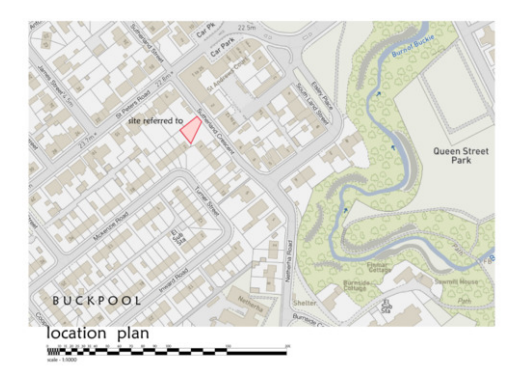
Building Plot at Sutherland Crescent Buckie Moray AB56 1DH