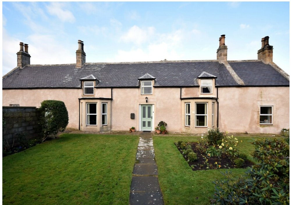
Offers Over £340,000

Occupying a prominent position in the popular village of Garmouth, is Stewart Place House – a charming and well-maintained 'C' Listed Detached Georgian villa dating back to approximately 1700. The substantial corner plot is located near the centre of the village and extends to approximately 1/3 of an acre.