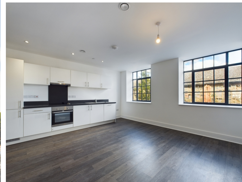
One Bedroom Apartment, The Old Works, Leigh Street, High Wycombe, HP11 2WP