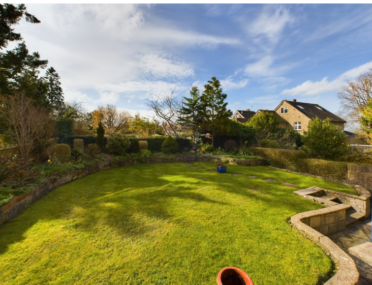
Culverton Hill, Princes Risborough, Buckinghamshire, HP27 0DZ