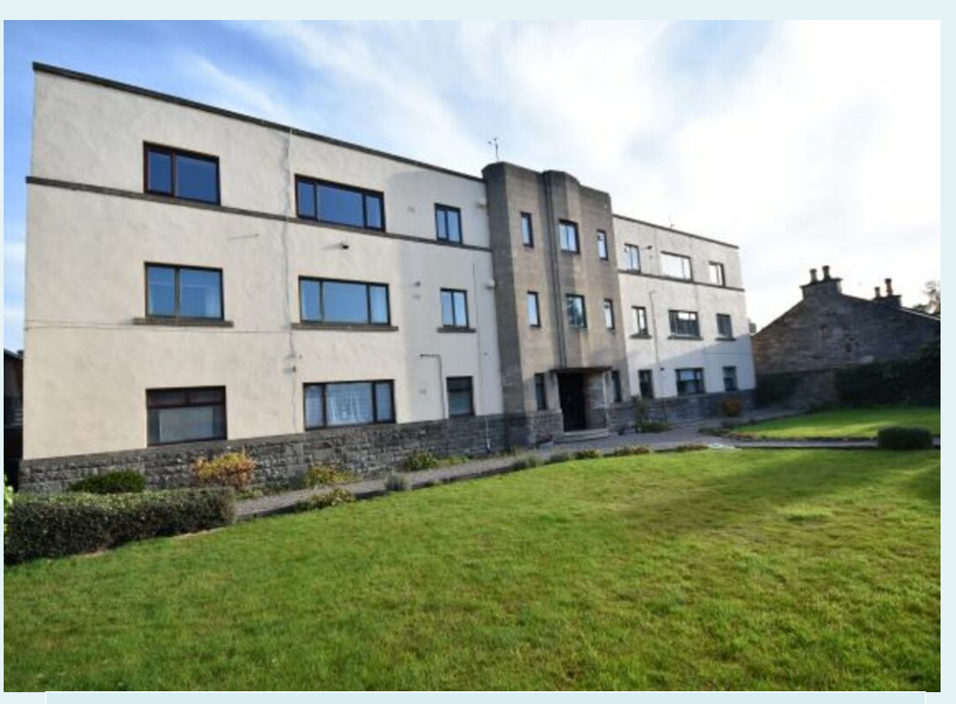
Part Furnished 1 Bedroom Top Floor Flat Strictly No Pets & No Smokers

Communal Entrance Door & Stairs lead up to the Flat Hallway, Lounge, Kitchen, Bathroom & Bedroom with fitted wardrobe space