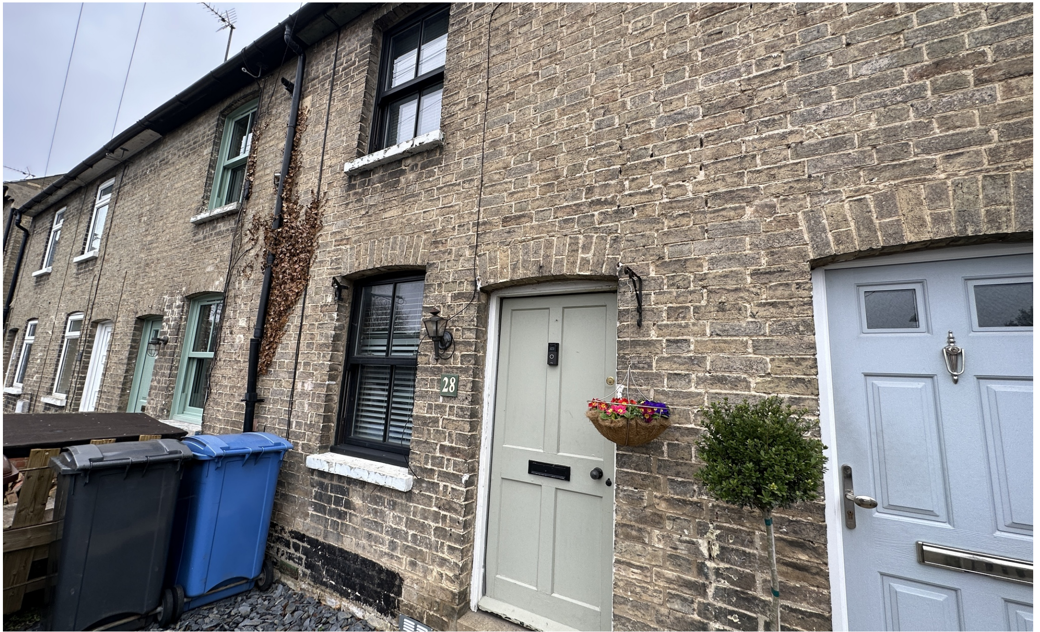
Church street Exning