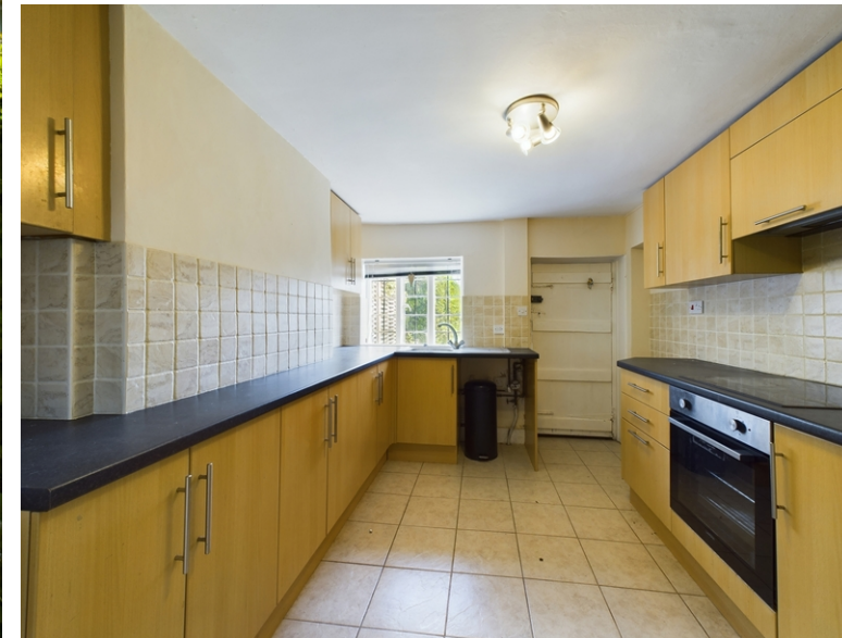
Mid Elm Cottage, Elm Road, Penn, High Wycombe, Buckinghamshire, HP10 8LF