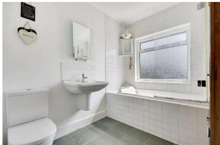
Old Moulsham £675,000 4-bed semi detached house