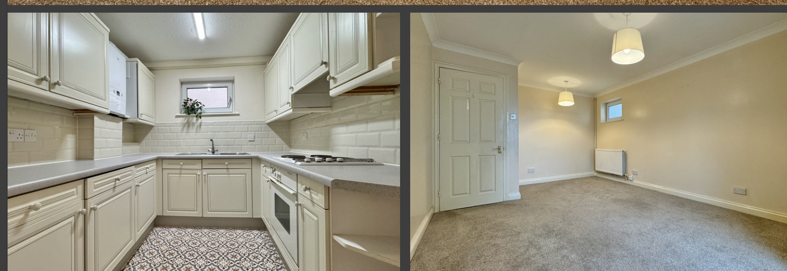
A spacious two bedroom first floor retirement apartment, situated in the sought after coastal area of Babbacombe in Torquay, offering easy access to Babbacombe Downs and local amenities