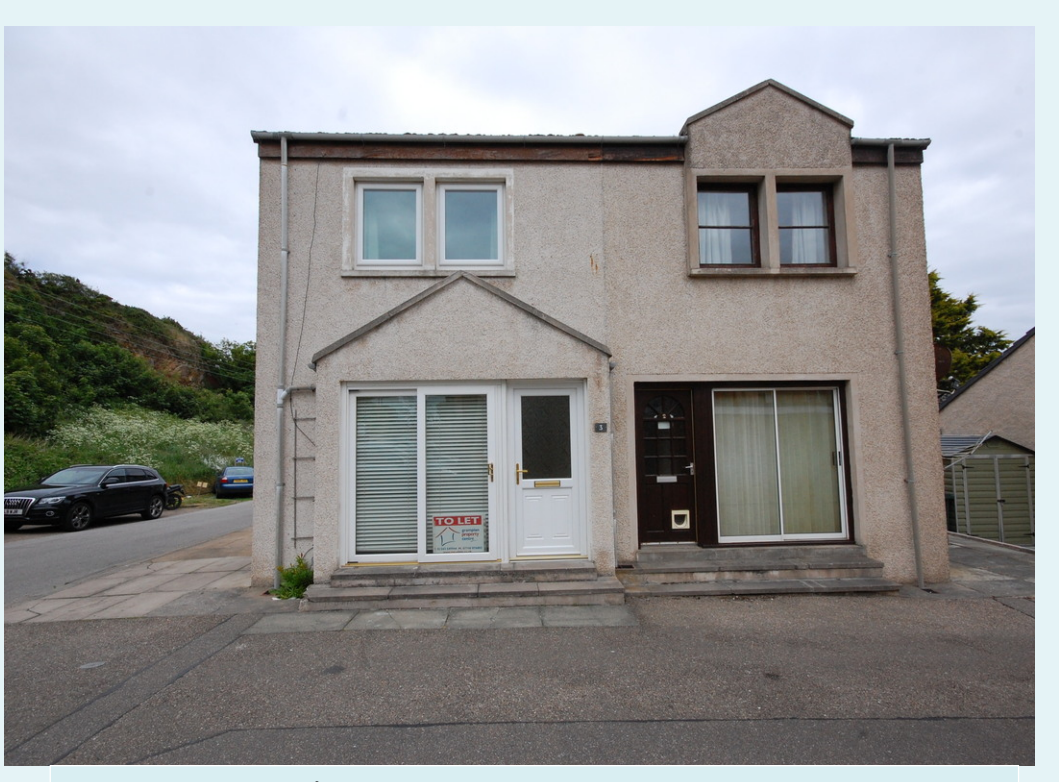
2 Bedroom Semi-Detached House No Pets & No Smokers

Entrance Area, Lounge, Kitchen with Integrated Hob & Oven, Bedroom 1 with Fitted Wardrobes & Double Bed, Bedroom 2, Bathroom