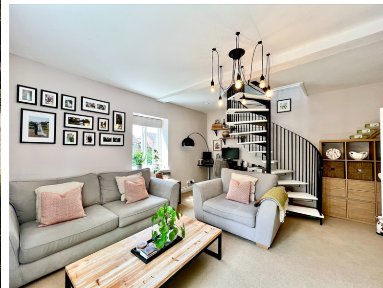
Totteridge House, Totteridge Lane, High Wycombe, Bucks, HP13 7LR