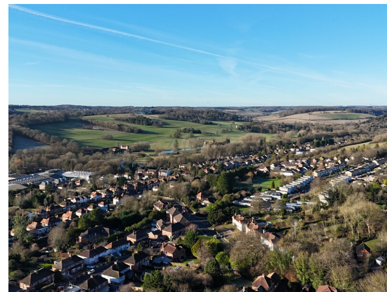
37 White Close, Downley, High Wycombe, Buckinghamshire, HP13 5NG