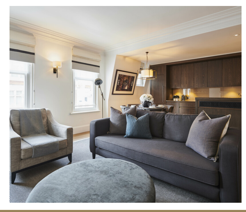
Fully Furnished Large 1 Bedroom Apartment to Rent on Duke Street in Mayfair, London W1.