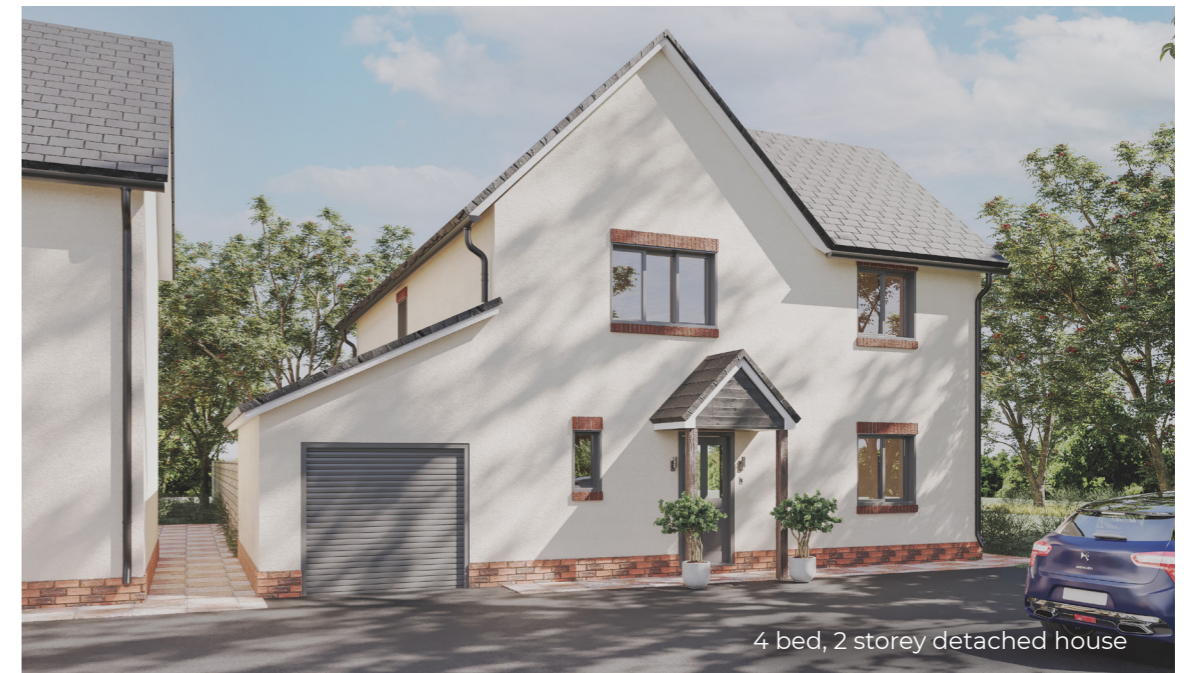
4 bed, 2 storey detached house

At heart of these homes lies a stunning open plan kitchen and dining area. Perfect for entertaining or family gatherings, the contemporary kitchen boasts top-of-the-line appliances and ample storage, inspiring your inner chef. The seamless flow into the dining space creates a warm, inviting atmosphere, making every meal a memorable experience. Escape to your own private sanctuary within the spacious bedrooms, offering tranquility and relaxation. With four double bedrooms, there's plenty of space for family members or guests. Unwind in the elegant master suite, complete with a luxurious en-suite bathroom. Step outside to discover generous gardens, providing a picturesque backdrop for outdoor activities or moments of contemplation. With enough room for gardening enthusiasts and play areas for children, the possibilities are endless. Ample parking and a garage ensure convenience and peace of mind, making coming home a delightful experience.