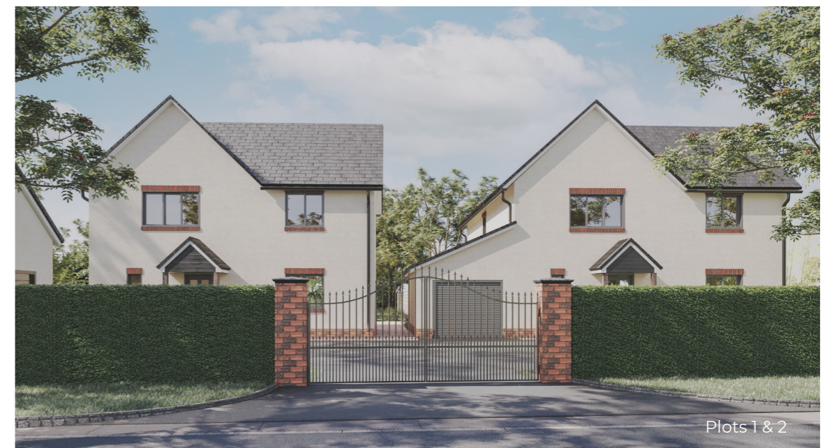
Plots 1 & 2