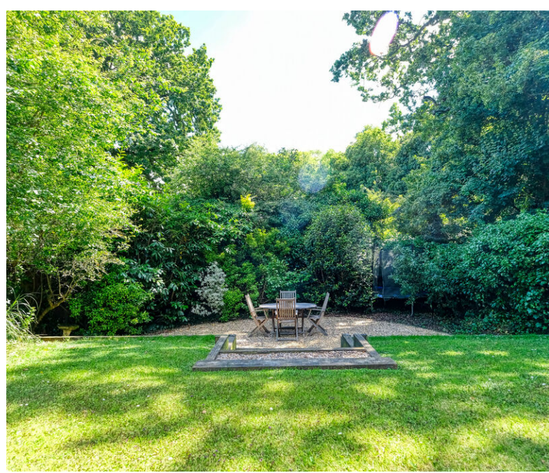
29 Hampden Drive, Norwich, NR70UT

EXECUTIVE, FOUR BEDROOM, DETACHED FAMILY HOME in a FANTASTIC POSITION backing onto woodland. Ideally situated for access to Norwich city centre, transport links and local schools, the property has been re-worked and updated to create a stylish and spacious home.