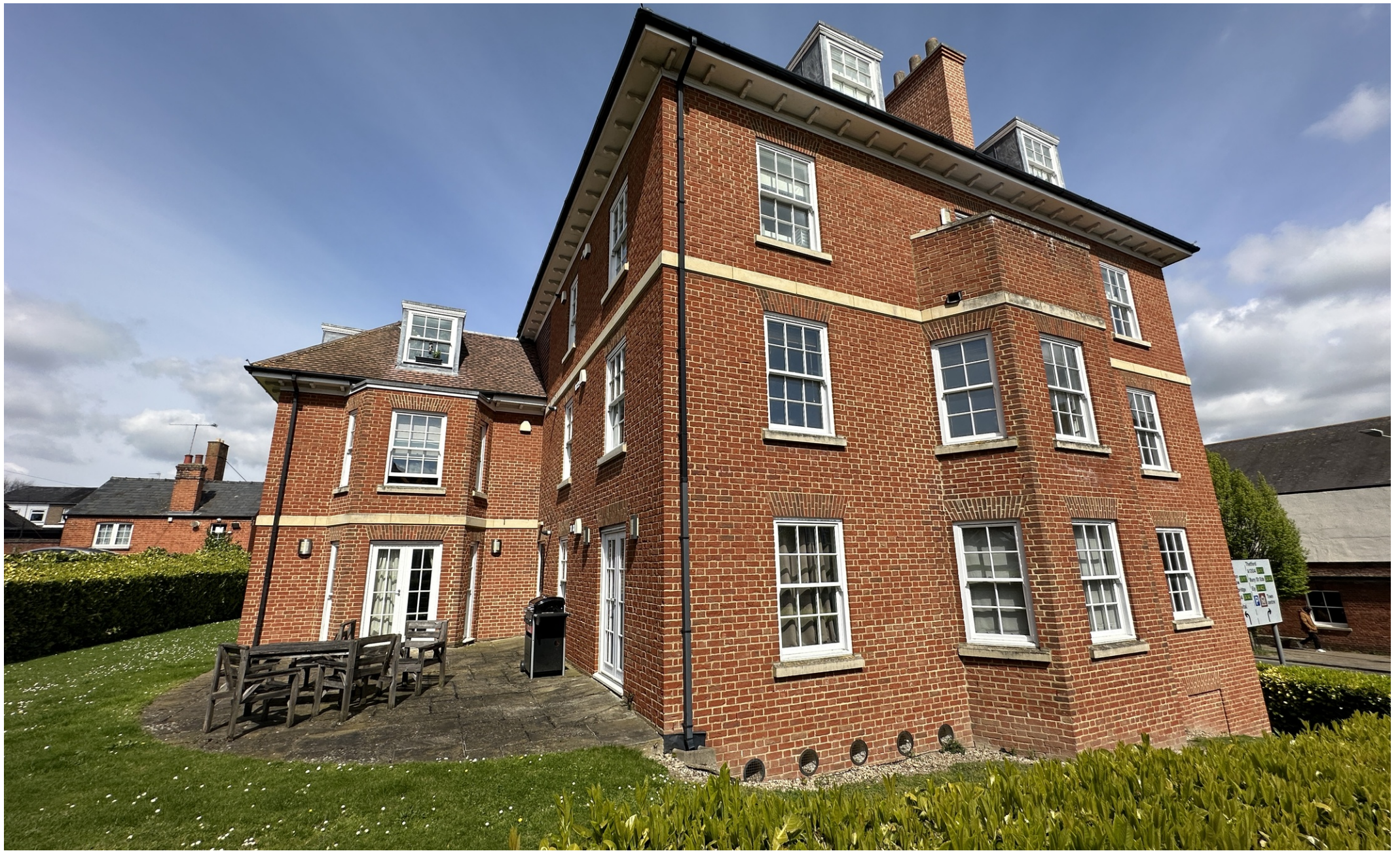
The Avenue, Newmarket, Suffolk