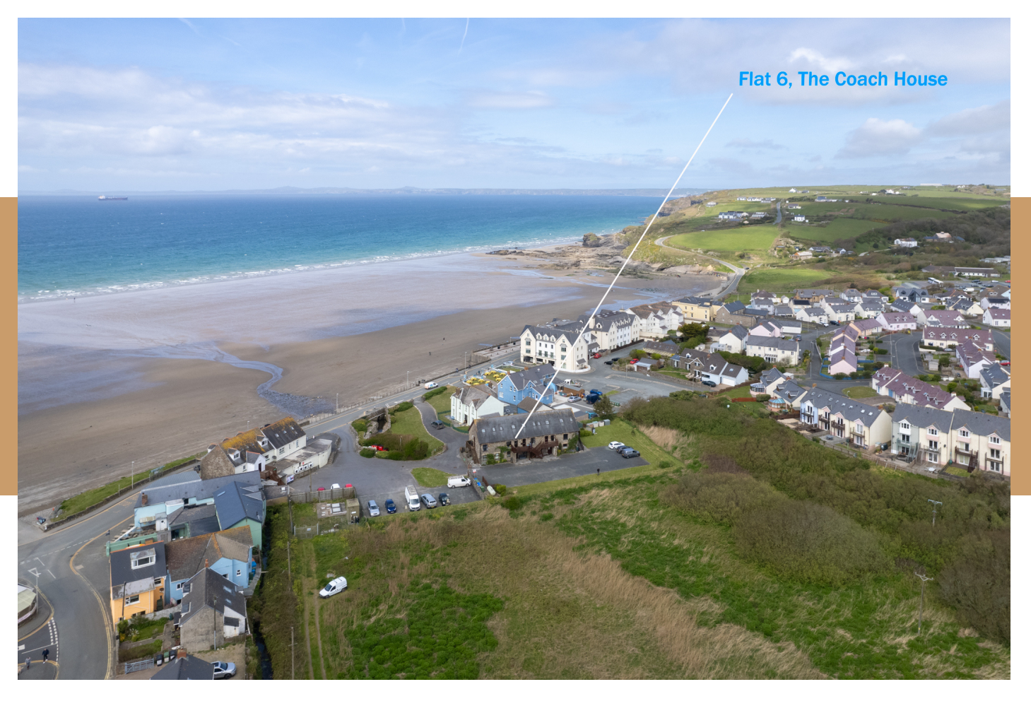
Bryce & Co are delighted to showcase this beautifully presented three-bedroom, two-bathroom apartment, set within a converted historic Coach House. Just a stone's throw from the renowned Broad Haven beach front, this property grants direct access to sandy shores and offers captivating coastal views.

Accessed via an external staircase to the first floor, the property welcomes you with a decked balcony area—ideal for al fresco dining or relaxation. Inside, the living area is filled with abundant natural light, complemented by elegant furnishings that create a luxurious yet comfortable space. The kitchen, seamlessly blending functionality with style, is equipped with all the essential amenities required for contemporary living. The apartment comprises three double bedrooms, each exuding character with features such as exposed oak beams that add a touch of historical elegance. The master bedroom benefits from a private en-suite shower room, while the family bathroom and the rest of the apartment continue the theme of exquisite presentation. Externally, the property offers a picturesque view over the private parking facilities and the meticulously maintained lawns stretching towards protected wetlands. Residents benefit from secure, gated parking, enhancing both convenience and security.