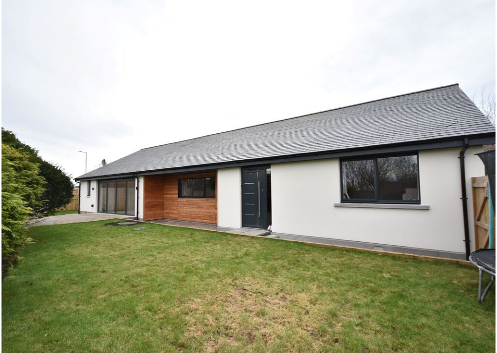
Offers Over £390,000

Located within close proximity to Elgin's High Street and local amenities is this 4 Bedroom Detached Bungalow which has been modernised and extended by the current owners. The property has also had planning permission passed to extend the property further which would offer a Sun Lounge.