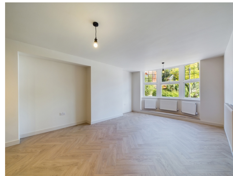
Flat 2, 148 London Road, High Wycombe, Buckinghamshire, HP11 1DQ