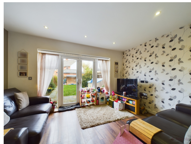
58 Sierra Road, High Wycombe, HP11 1GY