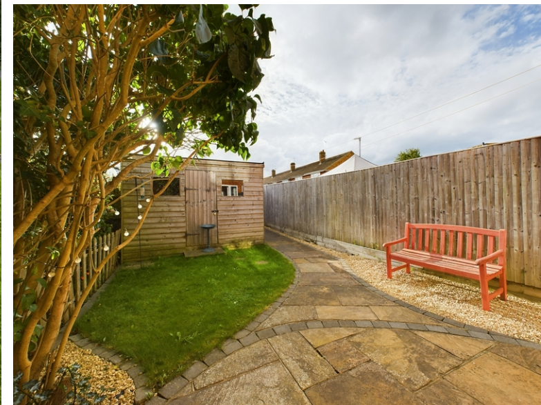
Brackley Road, Hazlemere, High Wycombe, Buckinghamshire, HP15 7EY