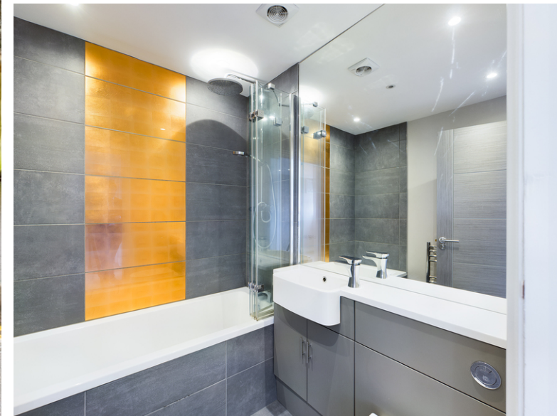
1 The Warren, Jackson Court, Hazlemere, High Wycombe, HP15 7EB