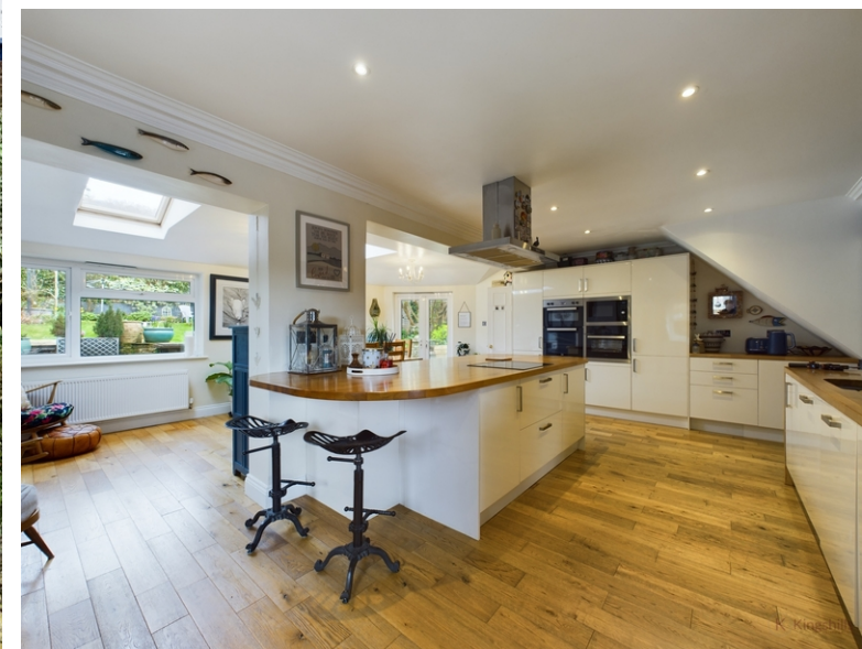
Friars Gardens, Hughenden Valley, High Wycombe, Buckinghamshire, HP14 4LU