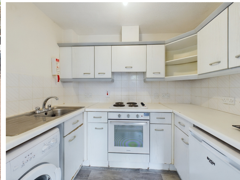
23 Alexandra Park, High Wycombe, Buckinghamshire, HP11 2HB