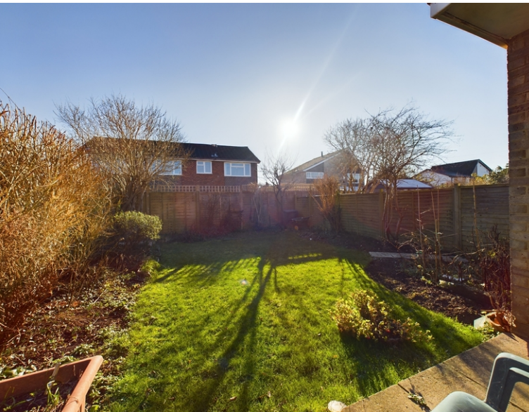
60 Fox Road, Holmer Green, High Wycombe, Buckinghamshire, HP15 6SF