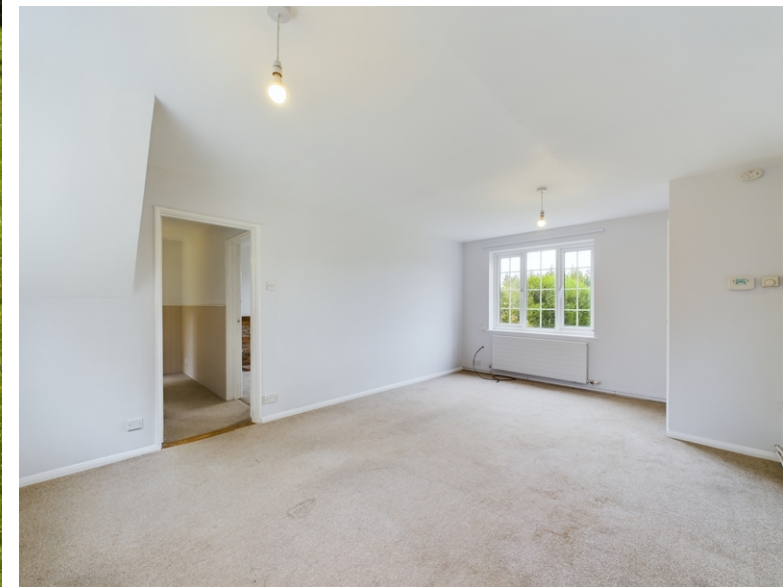
1 Stockings Cottage, Fryers Farm Lane, Lane End, Buckinghamshire, HP14 3NP