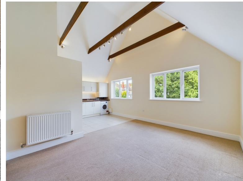
10 Eden Gardens, 179 West Wycombe Road, High Wycombe, HP12 3QG