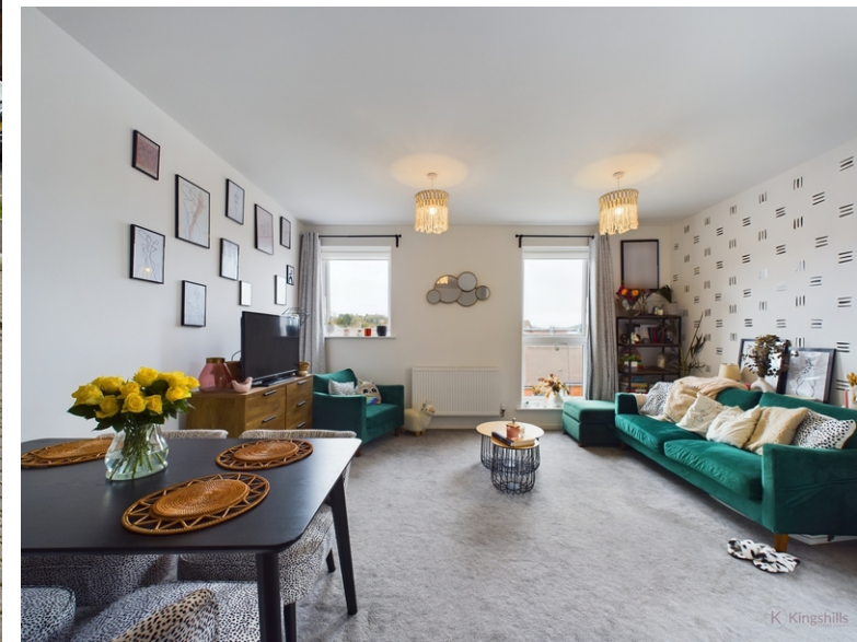
10 Barbel Court, Warbler Way, High Wycombe, HP12 3FH