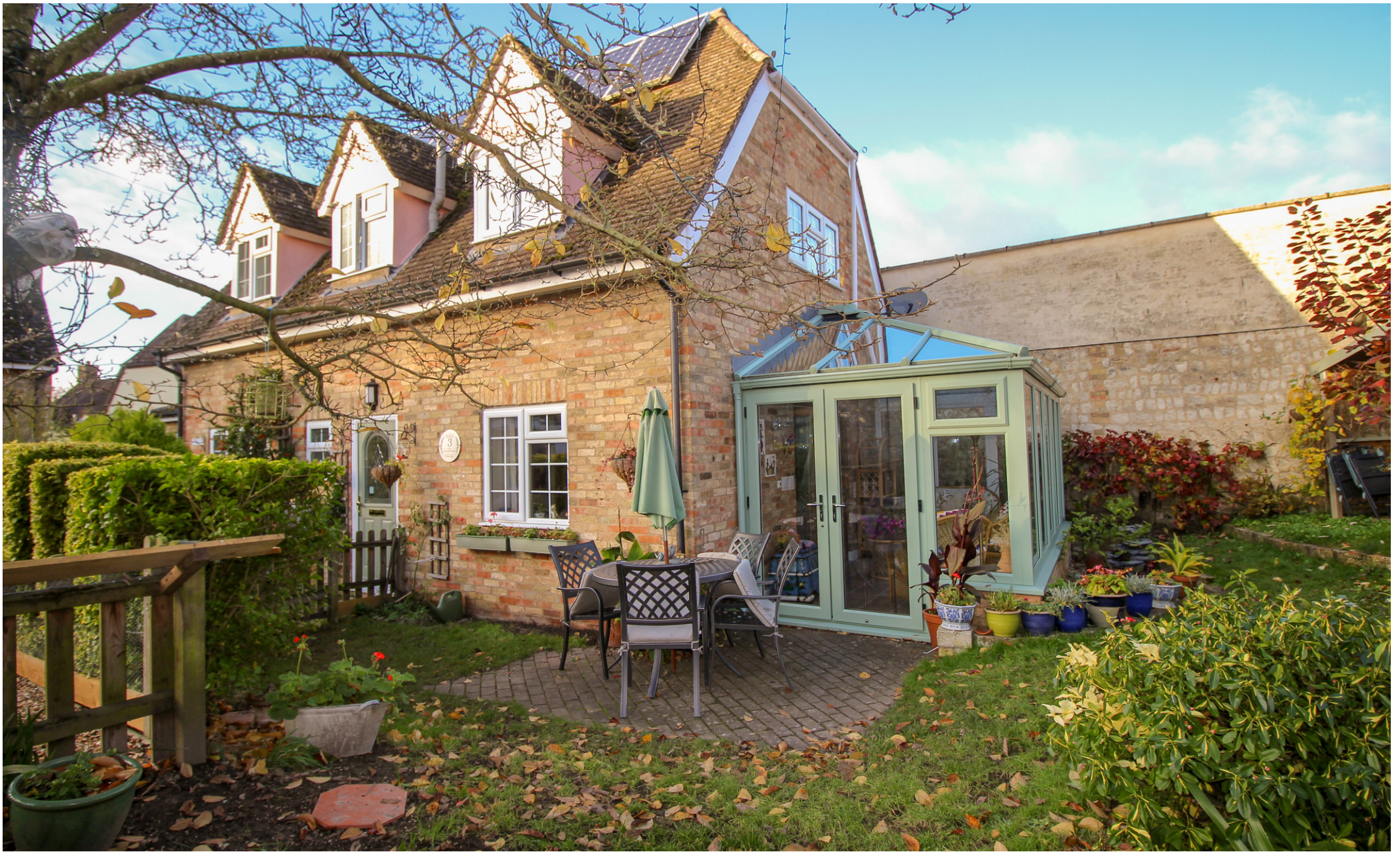
Sun Street, Isleham Cambridgeshire