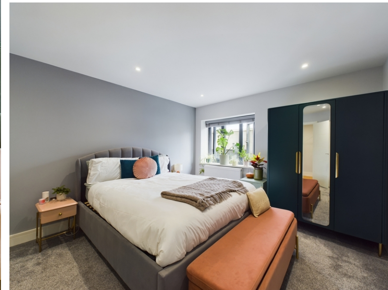
Flat 2, Treadaway Court, Loudwater, Buckinghamshire, HP10 9QL