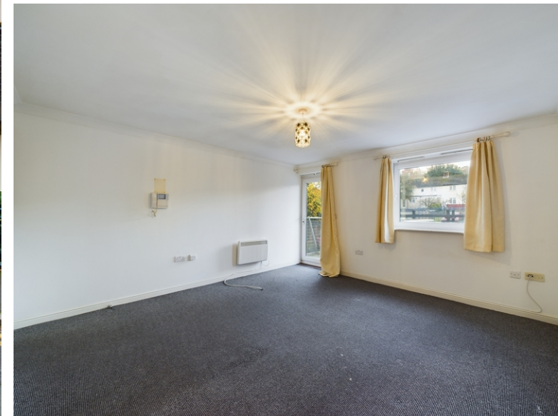
Flat 5 Kings View, West End Road, High Wycombe, Buckinghamshire, HP11 2PQ